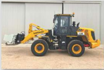
LIUGONG 835H WHEEL LOADER

Whether you are in agriculture, mining and gas, construction, civil engineering, rail and transport, defence or forestry, Michell Machinery Hire can help you with all your machinery hire requirements.