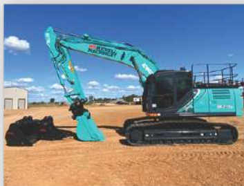
KOBLECO SK210LC-10 EXCAVATOR