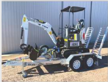
BOBCAT 1.7 TONNE EXCAVATOR