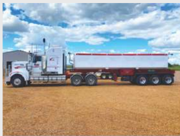
TRUCK & SIDE TIPPER TRAILER