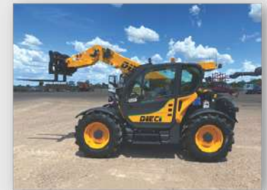
DIECI 40.7 TELEHANDLER