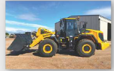
LIUGONG 856HX WHEEL LOADER