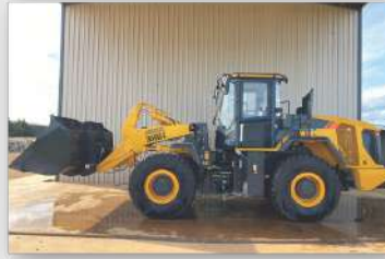
LIUGONG 848H WHEEL LOADER