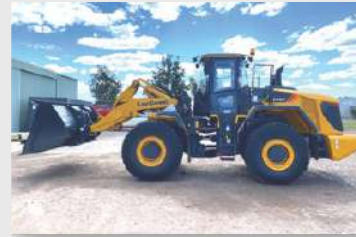
LIUGONG 856 WHEEL LOADER