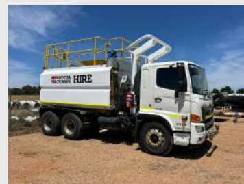
13,000L WATER TRUCK