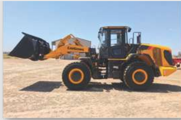
LIUGONG 848H WHEEL LOADER