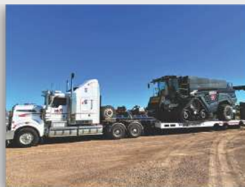
FREIGHT & TRANSPORT SERVICES