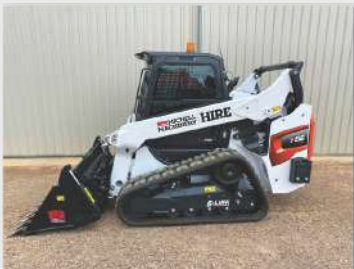
BOBCAT T66 SKID STEER LOADER