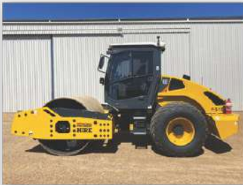
LIUGONG 6615E ROLLER