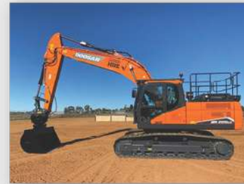
DOOSAN DX225LC EXCAVATOR